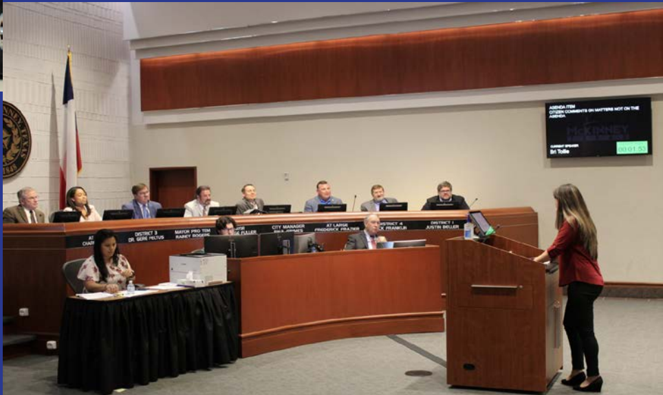
Tour of the city of McKinney and City Council presentation of our research