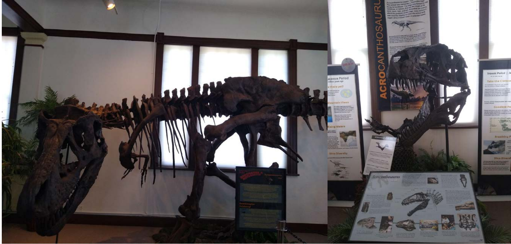
Picture of Ivan the Terrible T-Rex and other skeletons