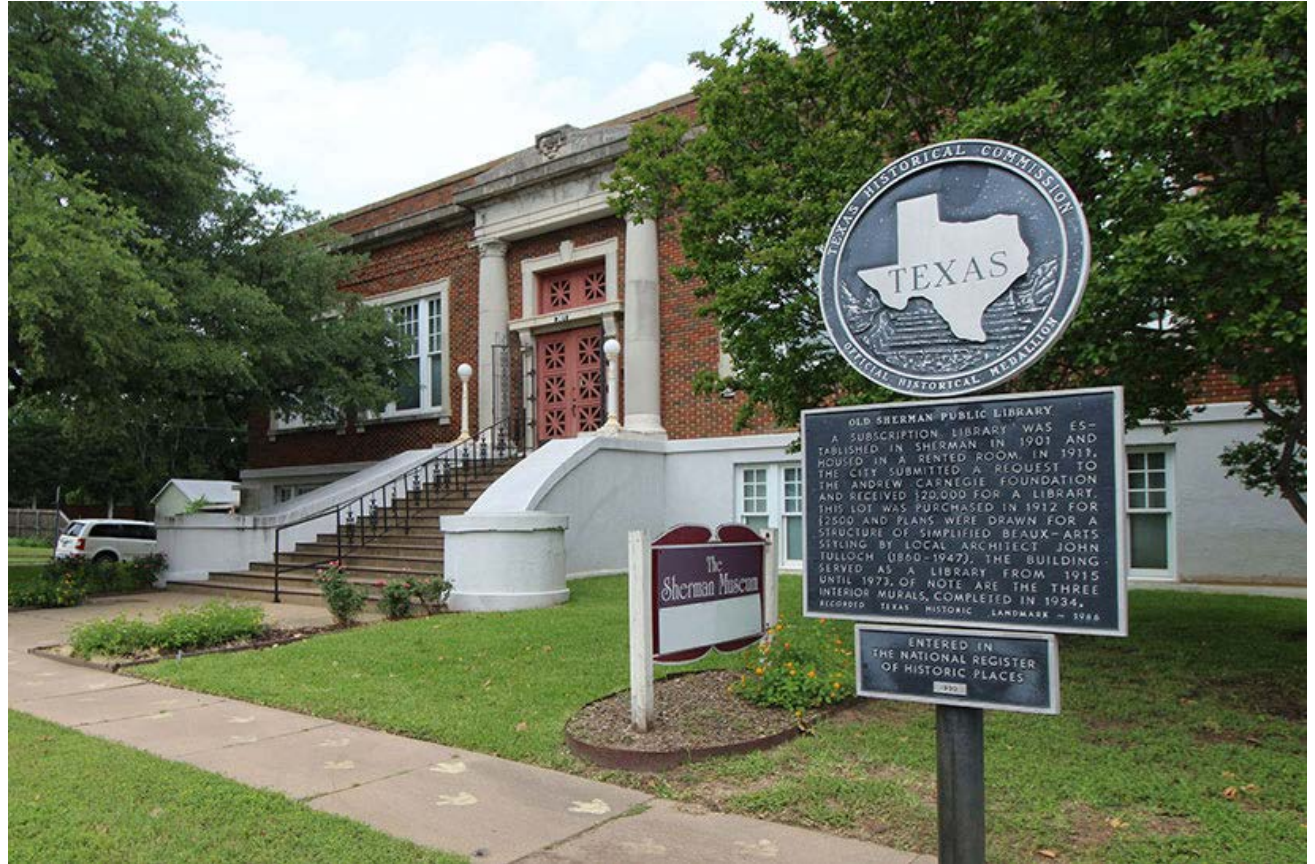
Picture of Museum