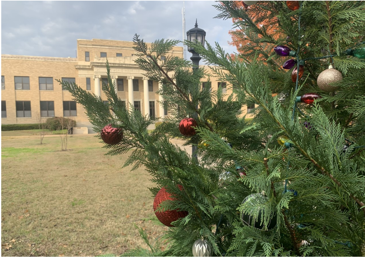
Windsor Mall has a new focal point with the planting of a live evergreen tree between Wynne Chapel and Caruth Administration Building as the official Christmas tree for the 'Roos. Donned with traditional ornaments and old-style bulb lights, it was lit after the annual Lessons & Carols concert on Thursday, December 1. The tree, purchased by Student Assembly, is a Leyland Cypress evergreen expected to grow 1.5 to 2 feet per year.