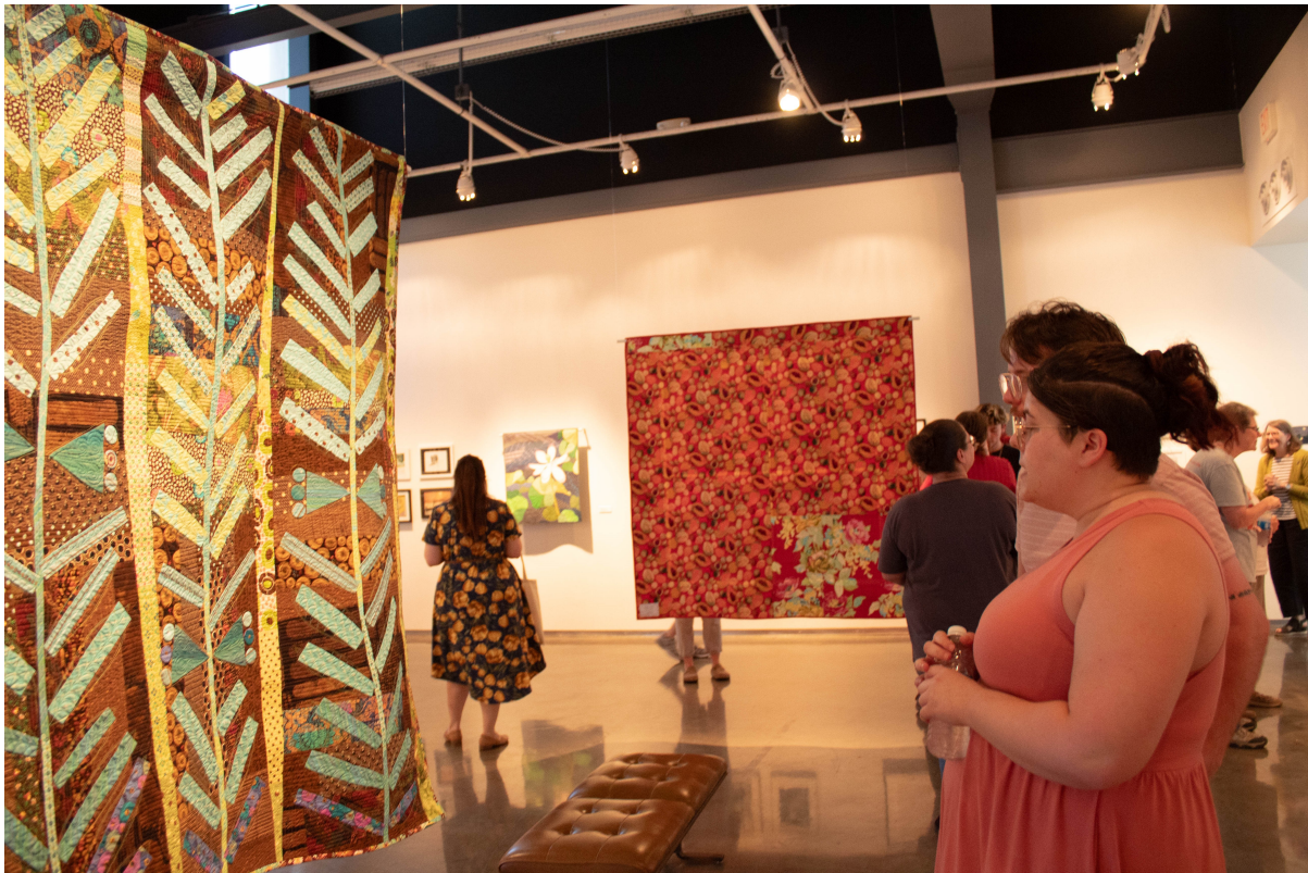
Exhibit shows artistic depth of AC Faculty/Staff